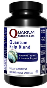
QNL Kelp Blend