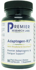
PRL Adaptogen R3