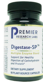
PRL Digestase SP