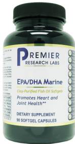
PRL EPA/DHA Marine