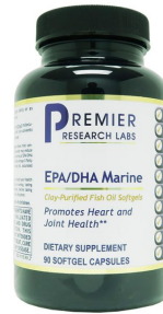
PRL EPA/DHA Marine