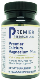
PRL Premier Calcium Magnesium Plus