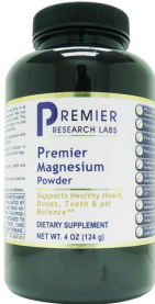
PRL Magnesium Powder