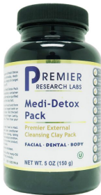
PRL Medi-Detox Pack