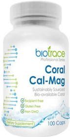
BioTrace Coral Cal Mag