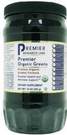
PRL Organic Greens