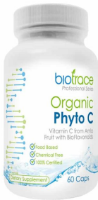
BioTrace Organic Phyto C