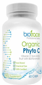
BioTrace Organic Phyto C