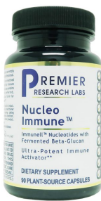
PRL Nucleo Immune