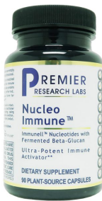
PRL Nucleo Immune