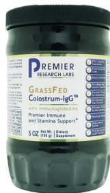
PRL Colostrum IgG Powder