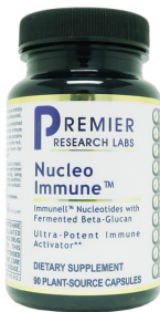
PRL Nucleo Immune