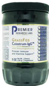
PRL Colostrum IgG Powder