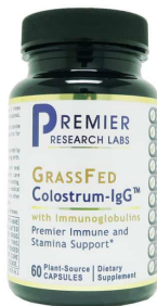
PRL Colostrum IgG Vcaps