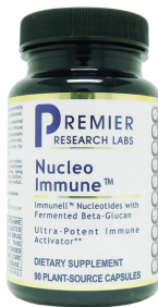
PRL Nucleo Immune