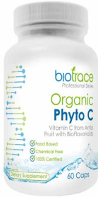
BioTrace Organic Phyto C