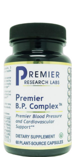
PRL BP Complex