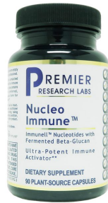
PRL Nucleo Immune