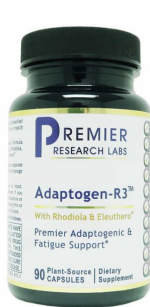
PRL Adaptogen R3