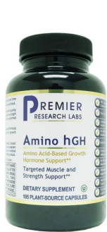
PRL Amino hGH