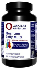
QNL Quantum Daily Multi