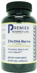
PRL EPA/DHA Marine