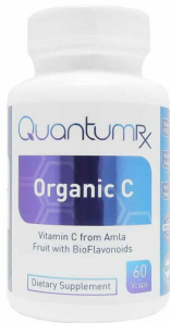
QuantumRX Organic C