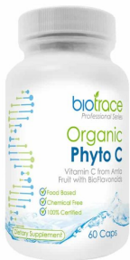
BioTrace Organic Phyto C