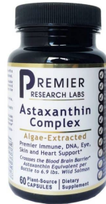
PRL Astaxanthin Complex