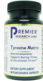
PRL Tyrosine Matrix