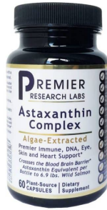
PRL Astaxanthin Complex