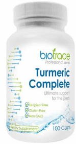
BioTrace Turmeric Complete