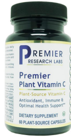
PRL Plant Vitamin C