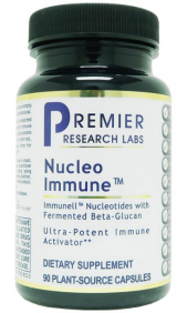
PRL Nucleo Immune