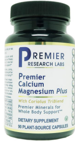
PRL Premier Calcium Magnesium Plus