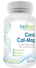
BioTrace Coral Cal Mag