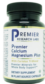
PRL Premier Calcium Magnesium Plus