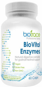
BioTrace BioVital Enzymes