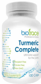
BioTrace Turmeric Complete