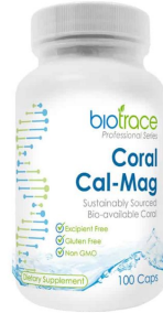
BioTrace Coral Cal Mag