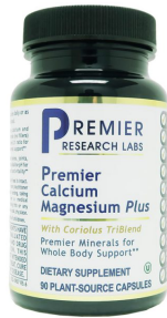
PRL Premier Calcium Magnesium Plus