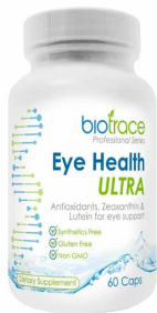
BioTrace Eye Health Ultra