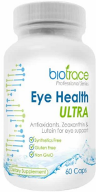
BioTrace Eye Health Ultra