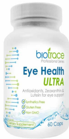
BioTrace Eye Health Ultra