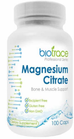
BioTrace Magnesium Citrate