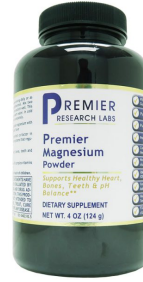
PRL Magnesium Powder