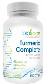
BioTrace Turmeric Complete