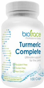
BioTrace Turmeric Complete