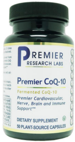
PRL CoQ 10