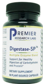
PRL Digestase SP