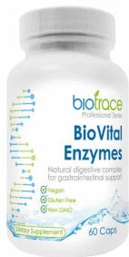
BioTrace BioVital Enzymes