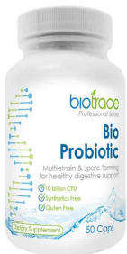
BioTrace Bio Probiotic