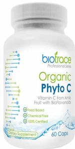
BioTrace Organic Phyto C