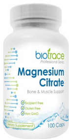
BioTrace Magnesium Citrate