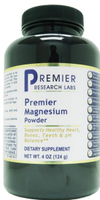
PRL Magnesium Powder