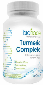
BioTrace Turmeric Complete