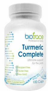
BioTrace Turmeric Complete