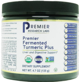
PRL Fermented Turmeric Plus