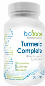
BioTrace Turmeric Complete