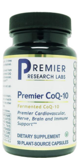
PRL CoQ 10