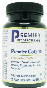
PRL CoQ 10