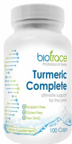
BioTrace Turmeric Complete