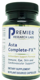
PRL Asta Complete