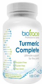
BioTrace Turmeric Complete