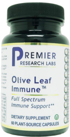
PRL Olive Leaf Immune