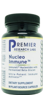
PRL Nucleo Immune