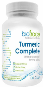
BioTrace Turmeric Complete