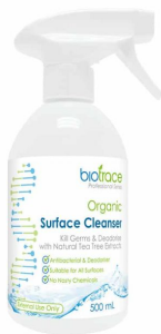
BioTrace Organic Surface Cleanser